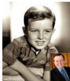
And Jerry Mathers As The Beaver