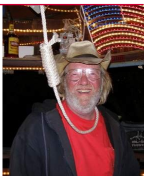
Buzzard out going Protector Of The Fork

Build the ingredients in a highball glass over ice. Stir.