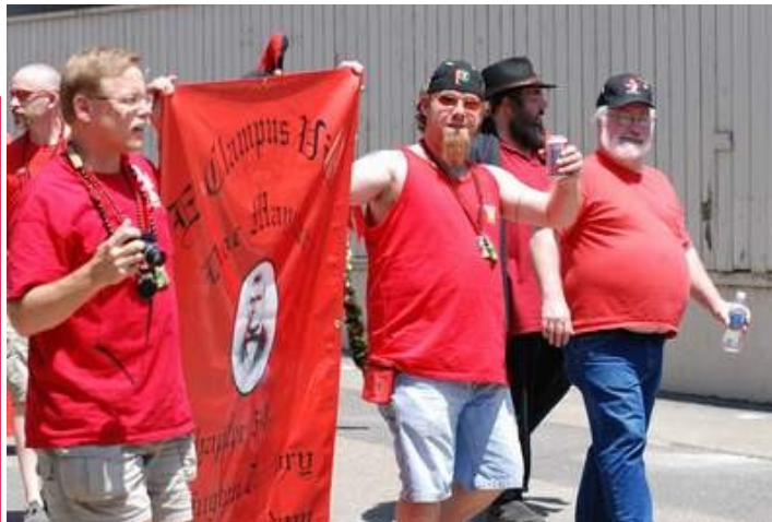
More of the WA boys at Grand Council