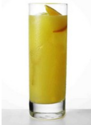
The June-go Citrus Splash